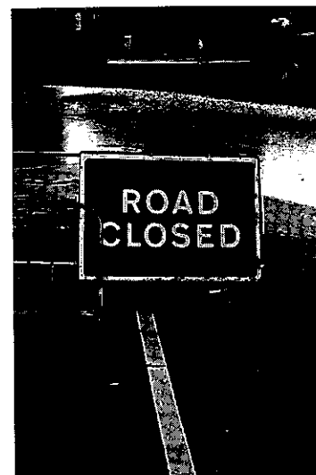
Figure 1 Flooded road

For these and other radical environmentalists, things such as carbon-offset schemes, or other measures imagined to be able to engage environmental degradation through a few adjustments to the market-led economy, seem inadequate and irresponsible. The current state of the world erodes the very legitimacy of given institutions and laws, often instilling the grimmer conviction that the industrial market economy and the modern state are essentially and structurally committed to the process of an endless capital accumulation